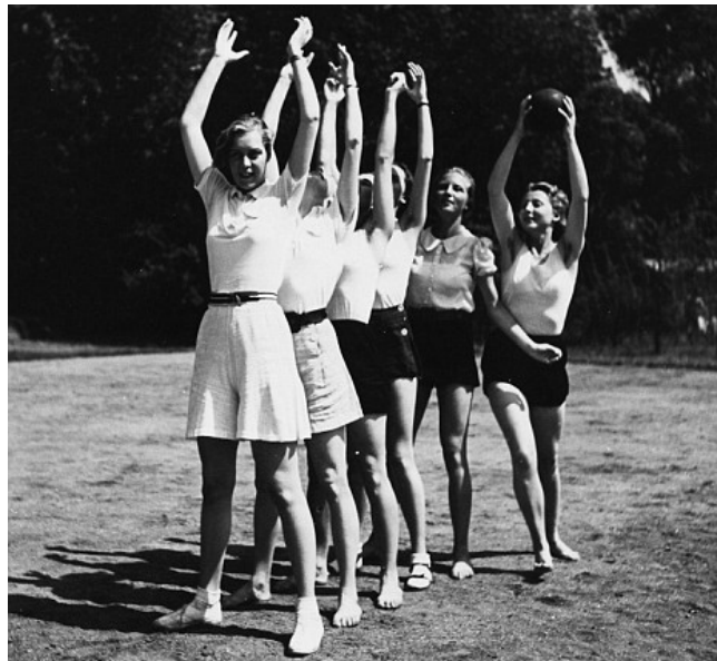
Lebensborn: A 'school for brides' in Berlin

December 12, 1935 —SS chief Heinrich Himmler orders the establishment of the Lebensborn (Fountain of Life) network of maternity homes. The purpose is to accommodate and look after racially and genetically valuable expectant mothers.