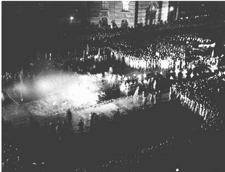
Burning of books in Berlin May 10, 1933.

May 10, 1933 —Books of “un-German spirit” are burned throughout Germany—20,000 volumes are destroyed in Berlin alone. In Berlin, a huge bonfire was lit in front of the Kroll Opera House. The books of Karl Marx, Ferdinand Lassalle, Sigmund Freud, Maximilian Harden and Kurt Tuscholsky were hurled into the flames.