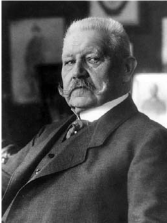
Paul von Hindenburg Weimar President 1925-1934