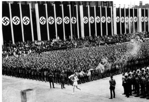
Torch relay of the 1936 Berlin Olympiad

The Berlin Olympics featured many “media firsts.” It was the first Olympic competition to use telex transmissions of results, and zeppelins were used to quickly transport newsreel footage to other European cities. The Games were televised for the first time, transmitted by closed circuit to specially equipped theatres in Berlin. The 1936 Games also introduced the torch relay for the first time. The torch relay of modern times which transports the flame from Greece to the various designated sites of the games had no ancient precedent and was introduced by Carl Diem. The relay, captured in Leni Riefenstahl's film Olympia , was part of the Nazi propaganda machine's attempt to add myth and mystique to Adolf Hitler's regime. Hitler saw the link with the ancient Games as the perfect way to illustrate his belief that classical Greece was an Aryan forerunner of the modern German Reich.