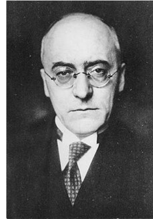
Dr. Heinrich Brüning Chancellor 1930-1932