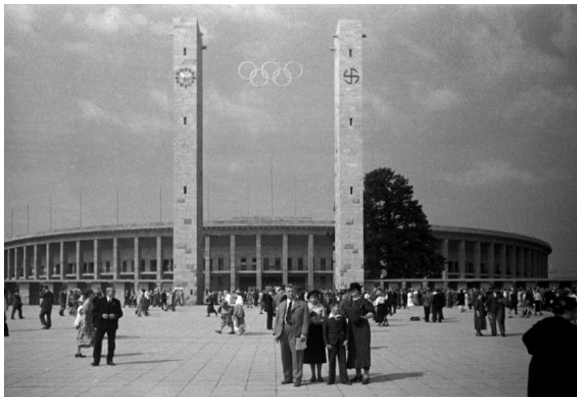
Olympic Stadium in Berlin 1936

By allowing only Aryans to compete for Germany, Hitler gained a world stage to promote his ideological belief in racial supremacy. During the run up to the games the Nazi Party removed anti-Jewish signs and slogans from the city's main tourist attractions. In addition, gypsies were arrested and removed from the streets in order to “clean up” Berlin. Filmmaker Leni Riefenstahl, a favorite of Hitler's, was commissioned by the IOC to film the games.