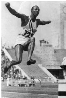
Jesse Owens in the long jump competition