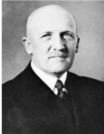
Gen. Kurt von Schleicher Author of "25/48/53"