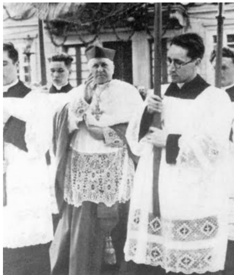
August Cardinal Hlond—The Polish Prelate

February 29, 1936 —August Cardinal Hondo, the head of the Polish Catholic Church, issues a pastoral letter advocating discrimination against Polish Jews “so long as they remain Jews.” He writes that Polish Catholics “ought to fence themselves off against the Jews’ harmful moral influence of Jewry” and “out to separate themselves from its anti-Christian culture.” Hlong goes on to say that Polish Catholics “ought to boycott the Jewish press” and other “demoralizing Jewish publications.” Hlong’s pastoral letter goes on to say: there will be a Jewish problem as long as the Jews remain...It is a fact that the Jews fight against the Catholic Church, they are free-thinkers, and constitute the vanguard of atheism, bolshevism and revolution. It is true that the Jews are committing frauds, practicing usury, and dealing in white slavery. It is also true that in the schools the Jewish youth is having an evil influence, from an ethical and religious point of view, on the Catholic youth. ”