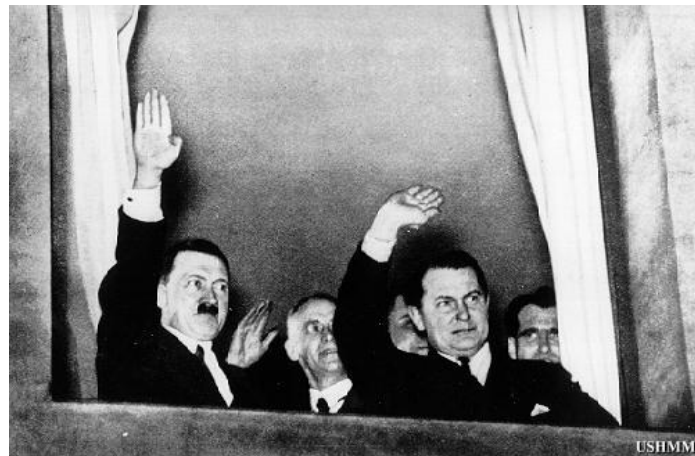
On the night of January 30, 1933, the Nazis organized a massive torchlight parade in Berlin to celebrate the appointment of Hitler as Chancellor of Germany. Above -- Adolf Hitler and Hermann Göring greet the participants in the parade as they pass beneath the window of Hitler's new office.

The Jewish population of Germany at the time was 565,000—less than 1%. Nazi ideology, however, required the elimination of Jews from German life.