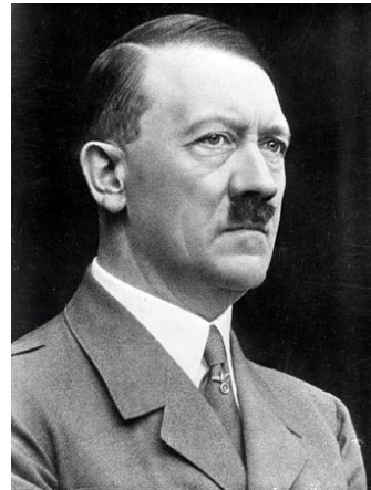
Adolph Hitler Chancellor—January 30, 1933 Presidency and Chancellery merge August 19, 1934-- Gleichschaltung :