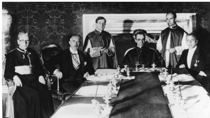
Bundesarchiv, Bild 153-R24301 Foto: o. Ang. | 20. Juli 1933

July 20, 1933 —The Reichconcordat is signed. The Reich Concordat was an agreement between the Vatican and the Nazi Government. The person primarily responsible for the negotiation and signing of this document was the Cardinal Secretary of State, Eugenio Pacelli, the future Pope Pius XII with the endorsement of Pius XI.