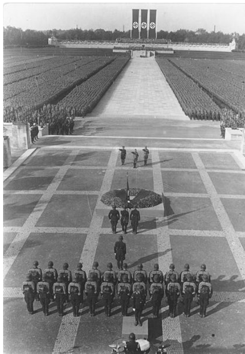
Rally of Unity and Strength" ( Reichsparteitag der Einheit und Stärke ), "Rally of Power" ( Reichsparteitag der Macht ) or "Rally of Will" ( Reichsparteitag des Willens ). The Leni Riefenstahl film Triumph des Willens was made at this rally.

September 4-10, 1934 —A massive Nazi Party Congress is staged at Nuremberg.